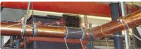
Vulcan S250 installed in the St. Joseph Hospital

This saves manpower and costs of the replacement of sanitary equipment. We can honestly recommend the unit installed by Christiani Wasertechnik GmbH ... "