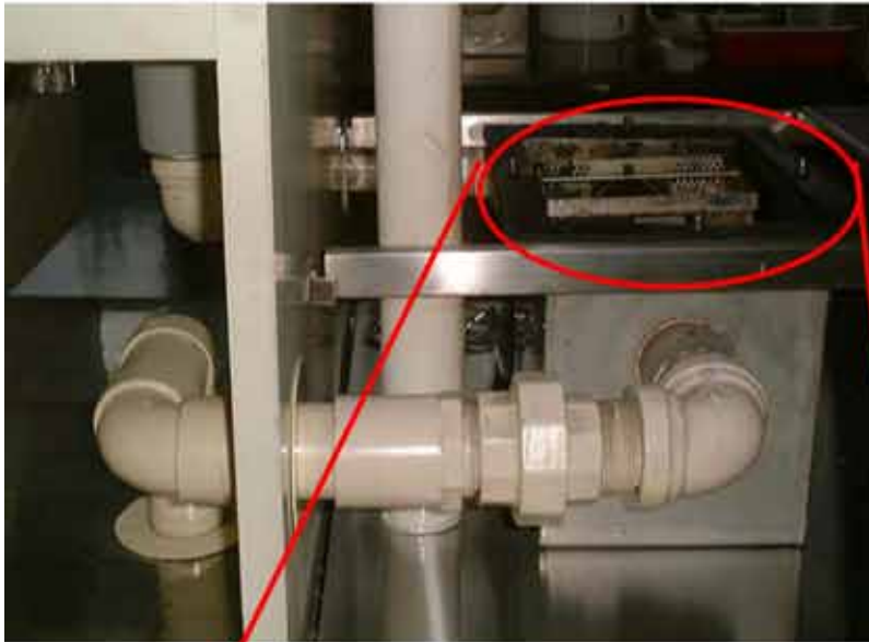
Grease trap under the countertop

On June 13 (before installation of the Vulcan) (* The Vulcan was installed on June 17.