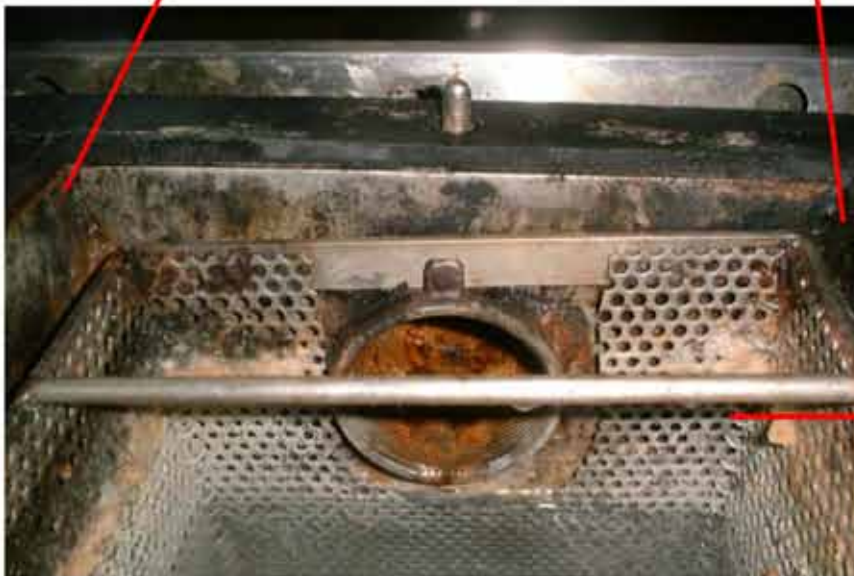
Usual level of the standing water: Water flows up to the level indicated by a .