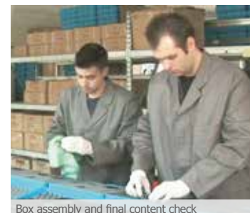
Box assembly and final content check

T: +49 (0)30 - 23 60 77 8-0 F: +49 (0)30 - 23 60 77 8-10 E: info@cwt-international.com W: www.cwt-international.com