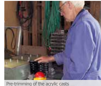
Pre-trimming of the acrylic casts