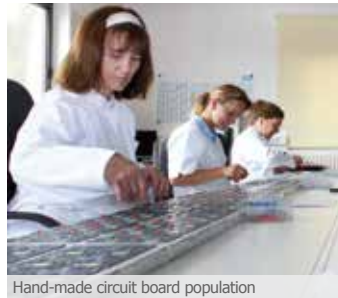
Hand-made circuit board population