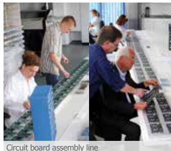
Circuit board assembly line