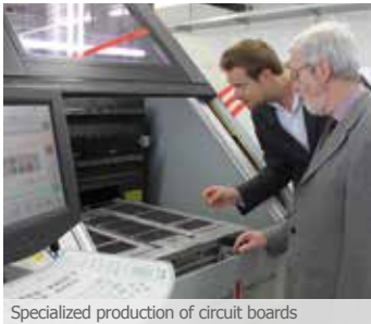
Specialized production of circuit boards