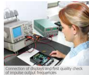
Connection of displays and first quality check of impulse output frequencies

CWT – Christiani Wassertechnik GmbH Köpenicker Str. 154 10997 Berlin Germany