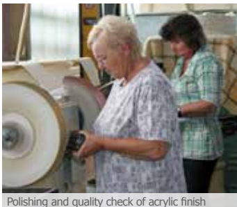
Polishing and quality check of acrylic finish