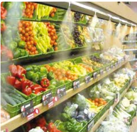
Misters in food section