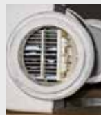
Swimming pool filter