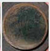
Biofilm in a piping system