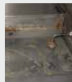
Grill plate in a kitchen