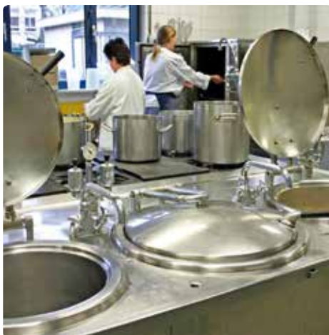
Professional kitchen on board of a military ship