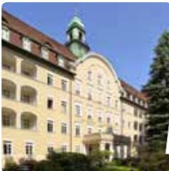
St. Joseph Hospital, Berlin