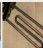
Heating element in a hot water tank