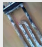
Heating element in a hot water tank