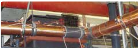
Vulcan S250 installed in the St. Joseph Hospital

This saves manpower and costs of the replacement of sanitary equipment. We can honestly recommend the unit installed by Christiani Wasertechnik GmbH ... "