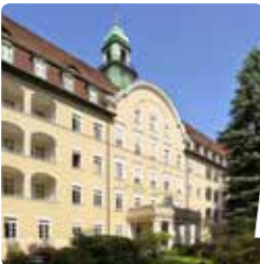
St. Joseph Hospital, Berlin