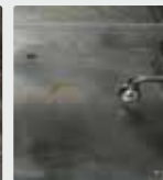
Grill plate in a restaurant