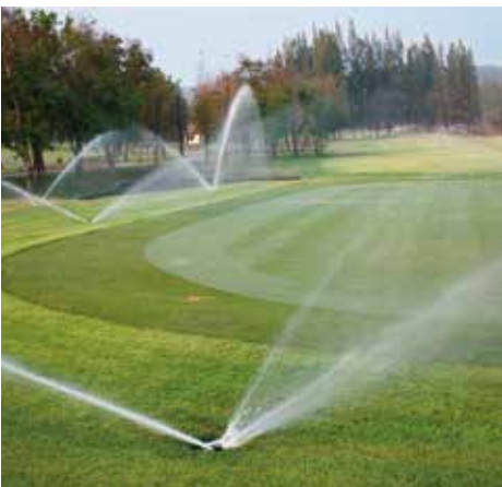
Sprinkler system in a golf course