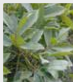
Plants and turf