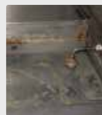
Grill plate in a clubhouse restaurant