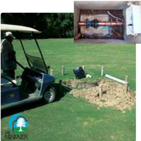
Vulcan installed underground at Las Misiones Golf Course