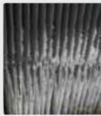
Cooling tower grids